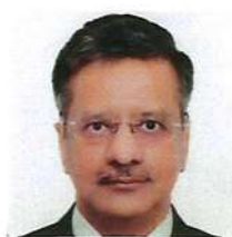
Newly appointed High Commissioner of India to Sri Lanka His Excellency Shri Gopal Baglay